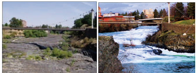
Upper Spokane Falls, with and without water.

◆ Spokane River Flow Campaign — CELP filed an appeal challenging conditions imposed on Avista's Spokane River Dams, to protect instream flows for Upper Spokane Falls and a struggling native redband trout population.